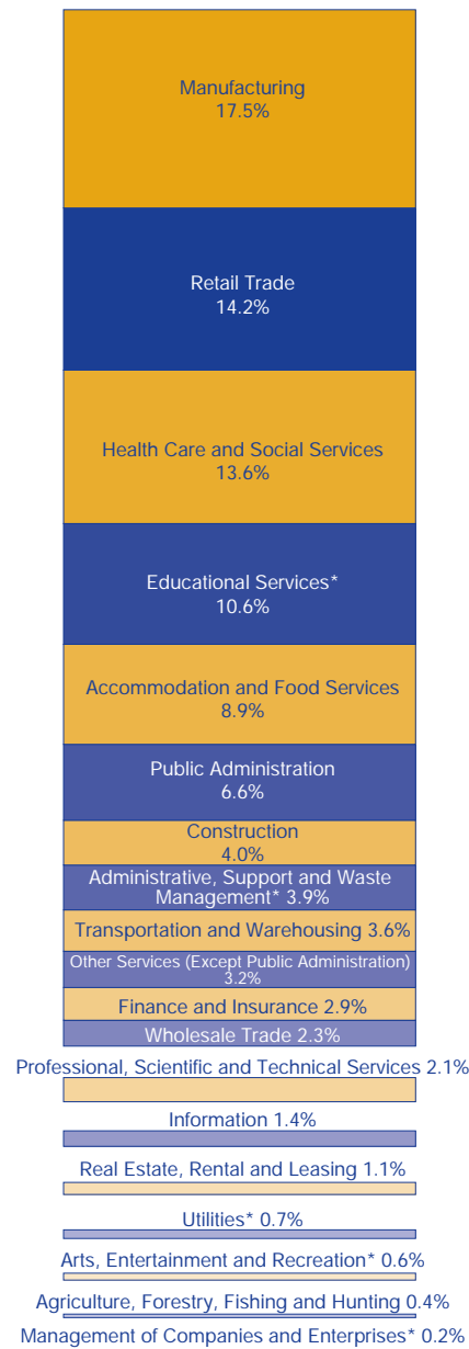
FIGURE 2: INDUSTRY DISTRIBUTION

In the southwest portion of the state next to Illinois is the Terre Haute Metropolitan Statistical Area (metro). Consisting of Vigo, Clay, Sullivan and Vermillion counties, the metro has a total population approaching 169,000. The city of Terre Haute, with a population of 57,224, is the only community in the region exceeding 10,000 people. Brazil,